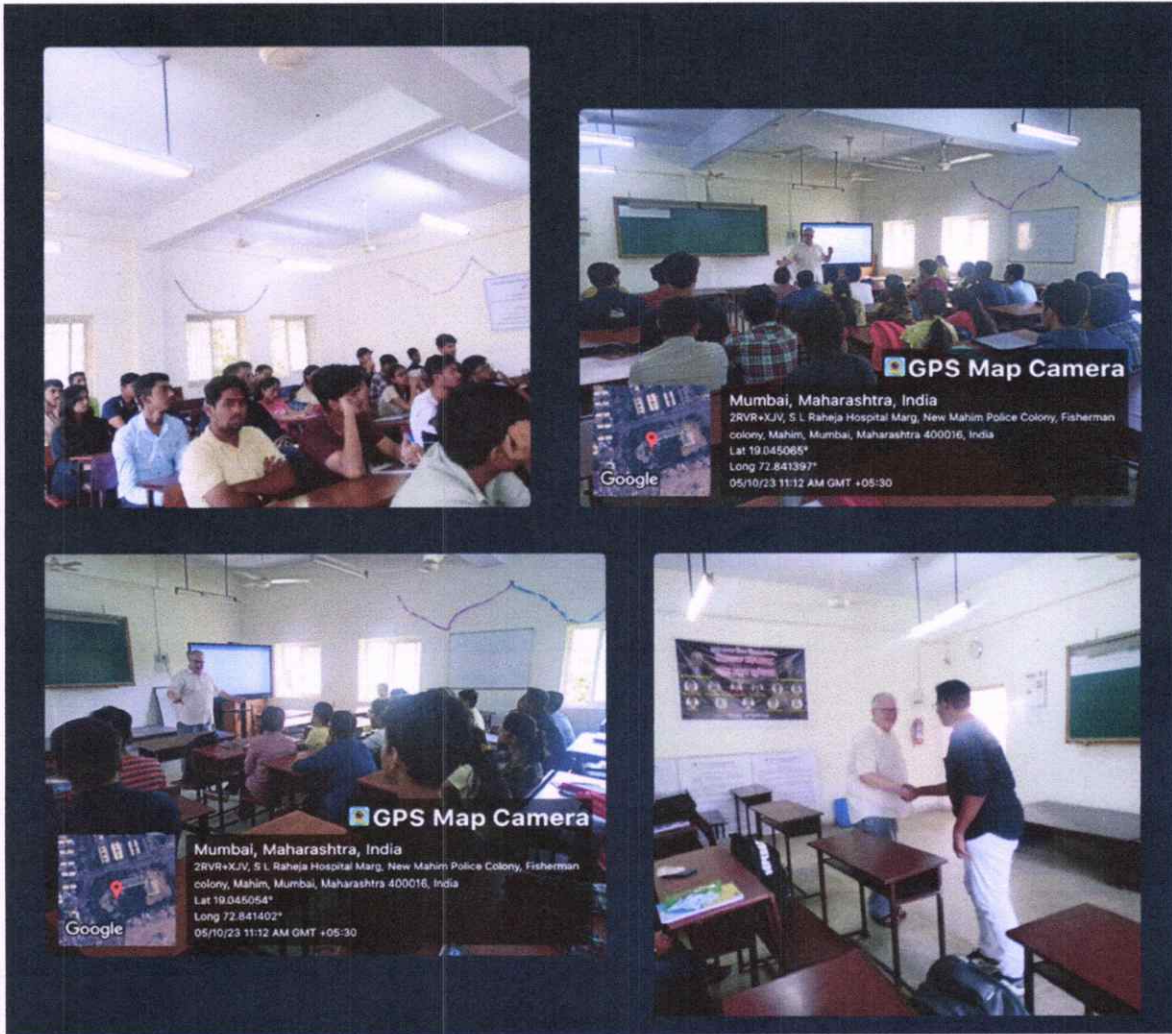
Fig: Participation of students in Higher Education Guidance Session